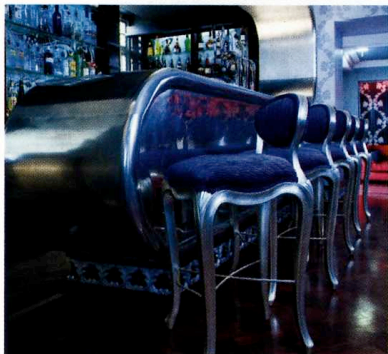
Plush perches invite guests to the Dylan Bar.

views. A few doors down is the much larger Georgian hotel, the Shelbourne ( www.theshelbourne.ie ; from $362). Dublin's grande dame was founded in 1824 and reopened last spring after a renovation. Walls feature elaborate plasterwork painted in brilliant reds and golds, and if only the walls could speak... history is everywhere. Pull up a stool at the Horseshoe Bar—decorated with original Hogarth prints—and you'll be sitting where politicians have gathered for decades. If the Constitution Room is open, pay homage to the site where Michael Collins and his brethren first drafted the Irish Constitution in 1922.